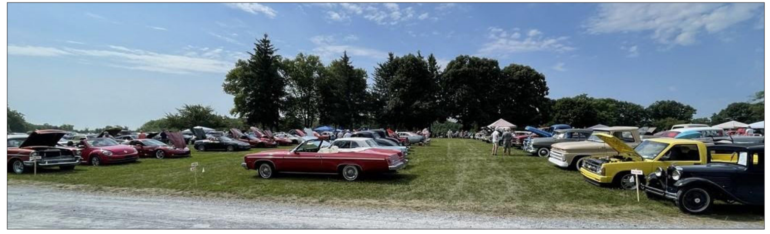
The 'backlot' at 800 West Hershey Park Drive in Hershey, Pennsylvania, July 24th. Three hundred-fifty plus vehicles of all types came together to celebrate CARMANIA! Who would have ever guessed Grand National winners next to ratrods...at the same event and on AACA hallowed ground!