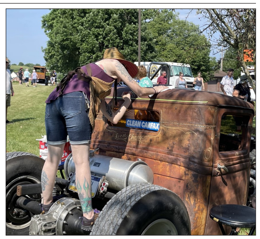
The young lady above didn't hold back any either. She jumped into her work with both feet and a lot of gusto!