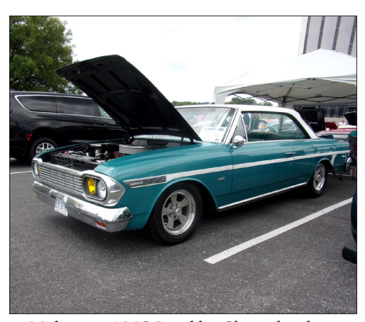
Mid 1960s AMC Rambler Classic hardtop.