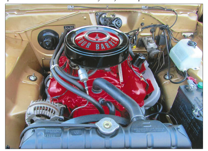
The Barracuda's mighty 340 cubic inch V8, naturally aspirated four barrel carburation. Engine bay is perfection.

My curiosity and interest took hold in wanting to find out more information regarding this car and previous owners. The car was built in the United States, then shipped and sold in Canada. Many receipts had names and phone numbers of previous owners, so I reached out to them.