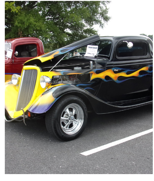
Another 1930s era modified Ford coupe.