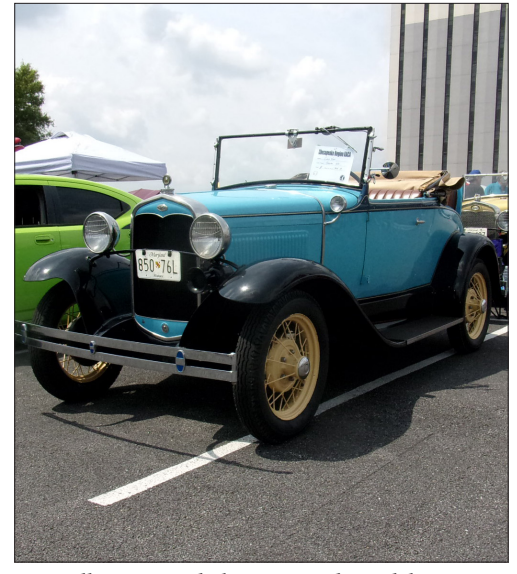
Really cute mid-thirties Ford Model A, rumble seat convertible.