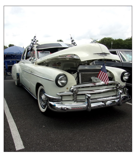
Restorod? 1950 Chevrolet coupe...