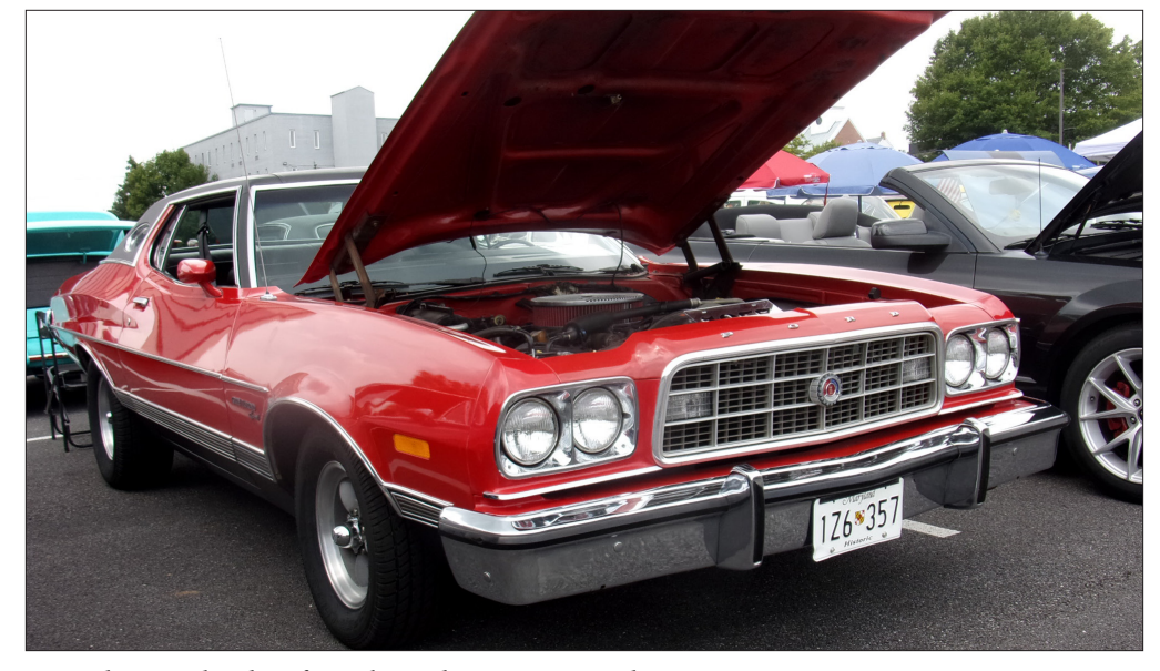
Ford Torino hardtop from the mid 1970s. Immaculate!