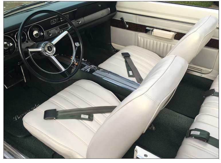
A touch of luxury! High-back bucket seats with an attractive shifter, console and gauge package.