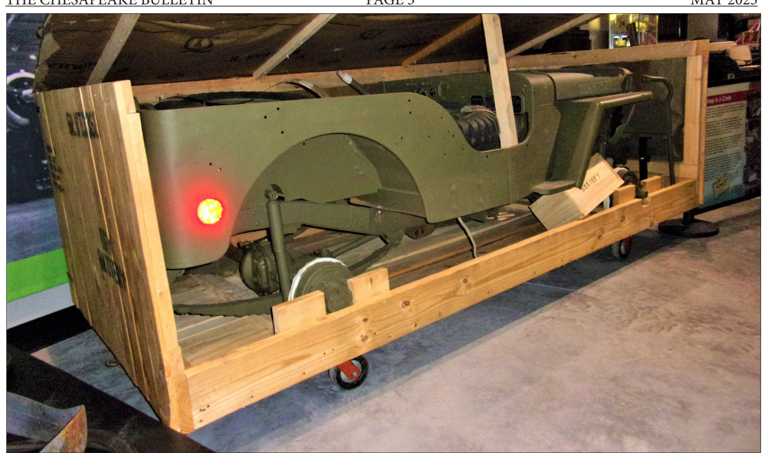
This is how military Jeep vehicles were crated for shipment on ocean going vessels and probably on some aircraft. Lots of trucks, tanks, Jeeps, and all sorts of equipment was sent to our Russian and English allies during the second world war. The allies probably found a good use for the wood crate too. U. S. Military Jeeps were so ubiquitous the English were convinced every U.S. soldier was provided with his own personal Jeep.