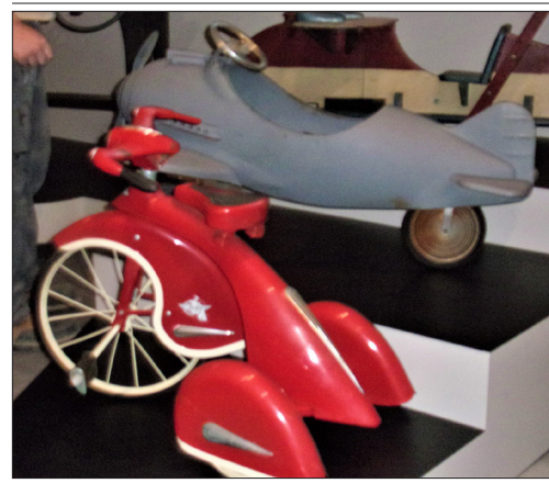
World War II era riding toys most likely only given to children in the U.S.A. and Canada.

Even though the day was a bit chilly and it rained off and on there were a lot of unique vehicles, such as a brand new International. School Bus, a nearly new and spotless trash compactor truck, a late model medium size excavator, ready for action! A couple new Howard County Police vehicles complete with LED flashing lights. The Howard County Emergency Response Vehicle that allowed adults and children to walk through the Command Center. This vehicle can go anywhere and assume control of any emergency situation.