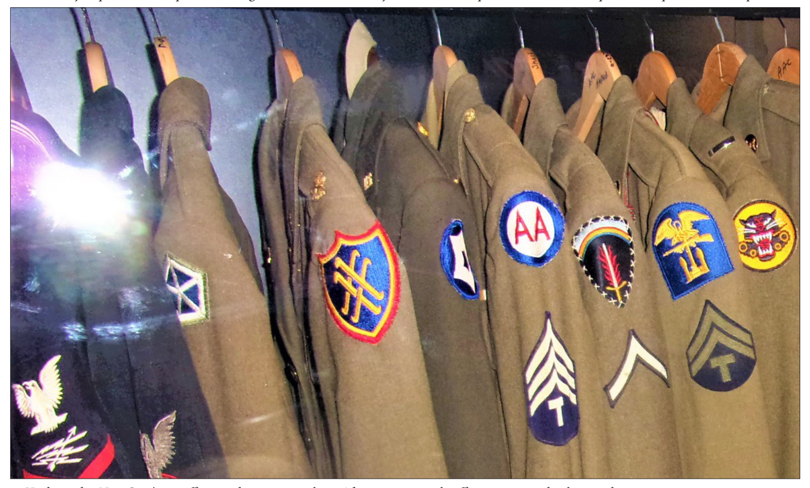
Uniforms for Non-Com's, no officer uniforms among these. After a certain rank, officers must pay for their uniforms.