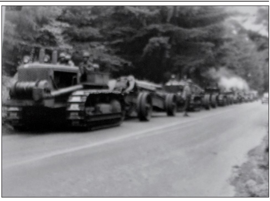
The M4 high speed tractor was developed during World War II as a means to tow artillery weighing 31,000 pounds and running at top speeds of 35 mph. The M4 was in use from 1943 to 1945 and primarily towed Howitzers and anti-aircraft weaponry. Before the high-speed tractor was was put into use, soldiers had to train to operate the vehicles. Pictured above is a group of soldiers training on bulldozers pulling leftover World War I gun carriages. The bulldozers they trained with averaged speeds of less than 10 mph, a big jump to the M4.