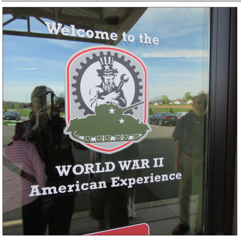
This is the first thing you see on the front door to the Museum.

Chesapeake Region, AACA Collector Car Club - Maryland