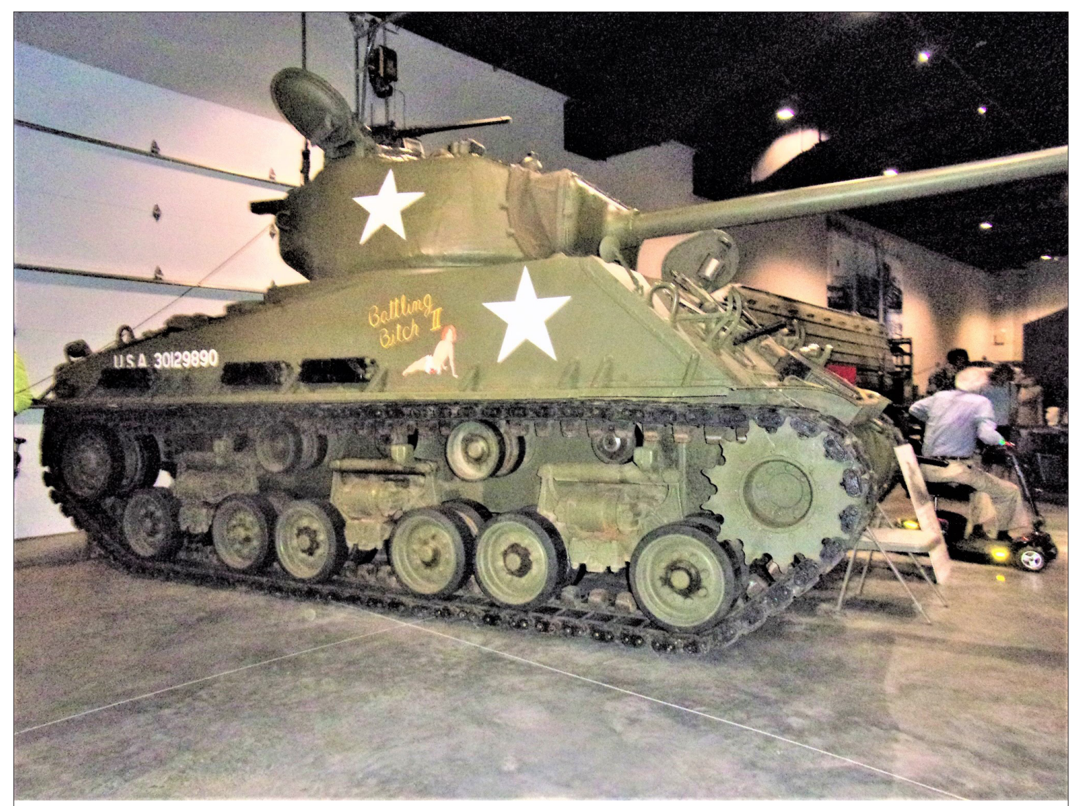
The 1945 M4A2 Sherman tank Easy model with 76 mm main gun. Twin 6 cylinder General Motors Diesel engines, built by Fisher Body. Requires five crew members to operate. Equipped with: 1-50 caliber machine gun mount on turret. 1-30 caliber machine gun M1919 in turret. One 30 caliber machine gun M1919 in Beaumont. Five-45 Waksman M3. Combat loaded weight 73,400 pounds, maximum speed 30 mph. Owned by the Buck family, motor pool at Gettysburg, Pennsylvania.