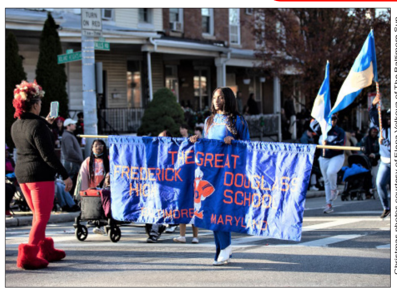
The popular Frederick Douglas High School marching band made a sol id appearance with a great sound and precision marching.