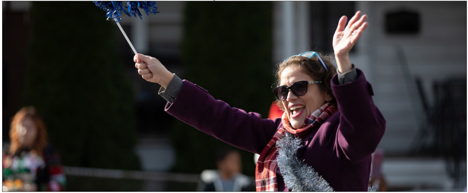
A very exuberant parade watcher