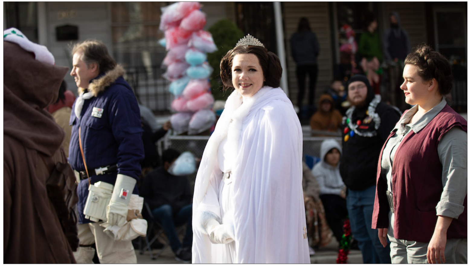
Princess Leia of Star Wars...May the force be with you!