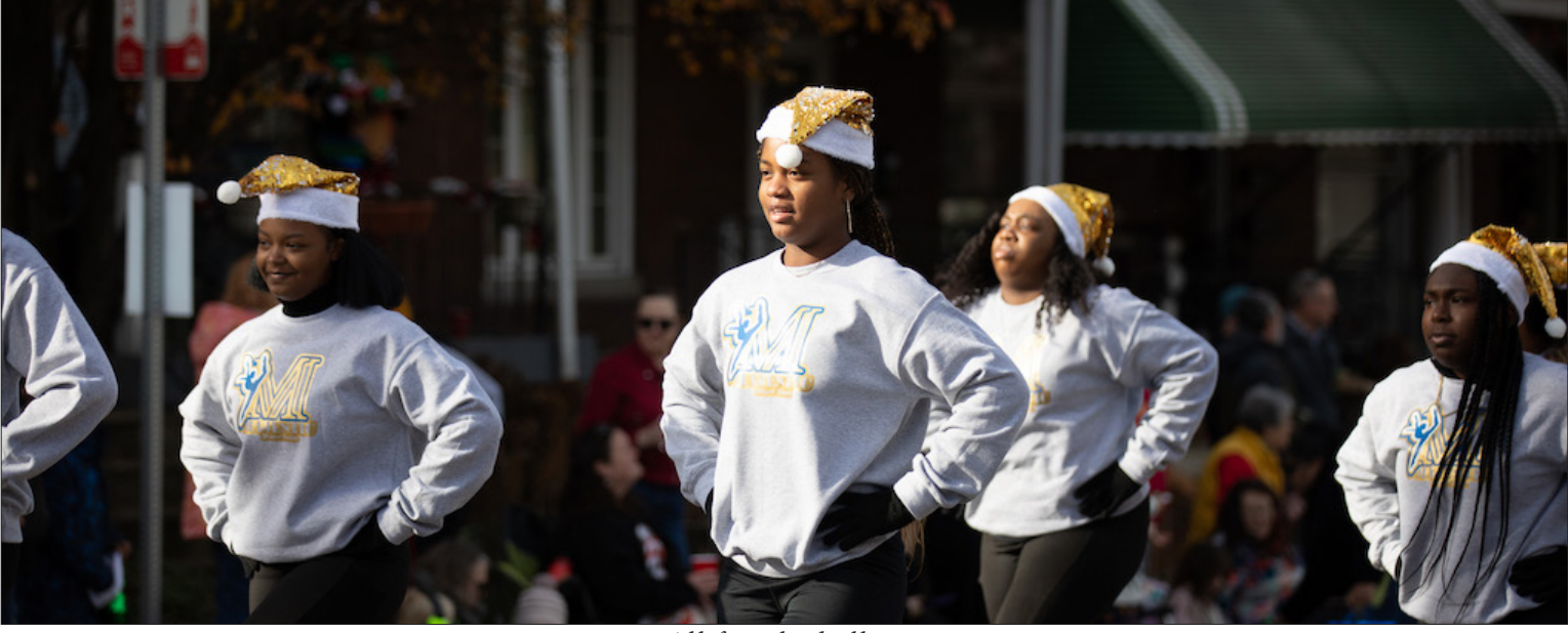
All female drill team