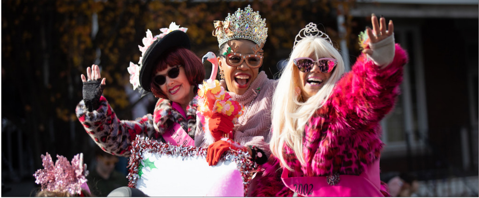
A queen and her court