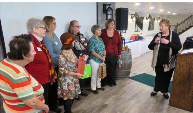
Thanking the ladies who held offices in 2025 and others who gave such much of their time this year!