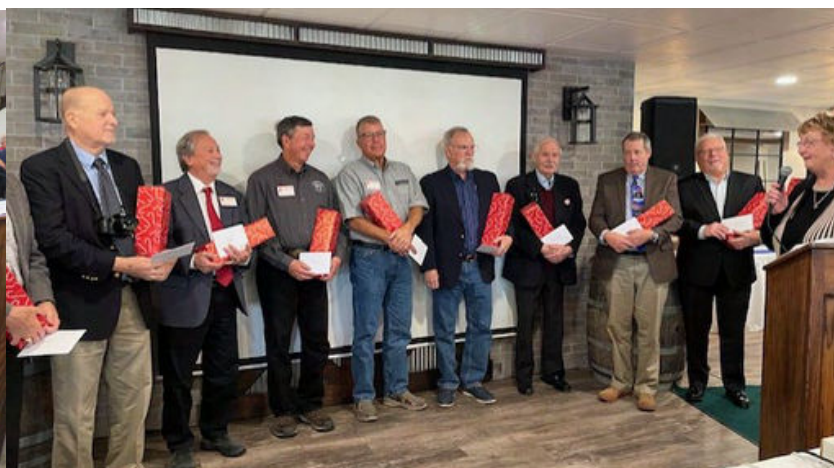
Thanking the men who held offices throughout 2025 and gave time to all of our activities.