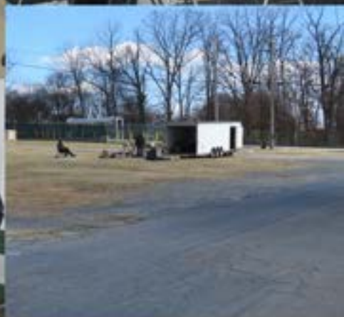
Waiting for the last sale