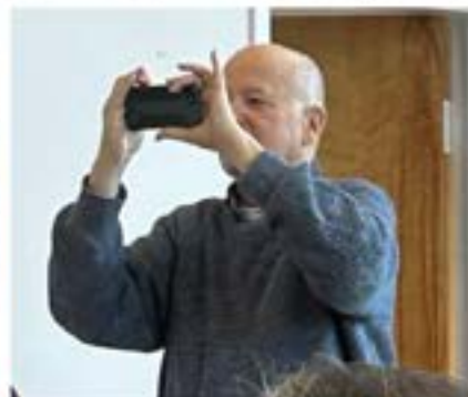
Buzz in Action