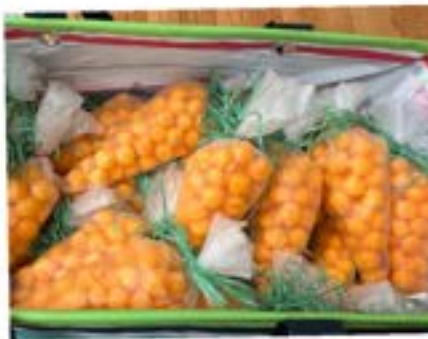
Carrots for everyone!